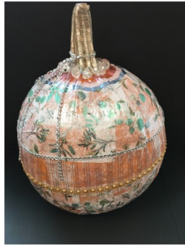
"All That Glitters"