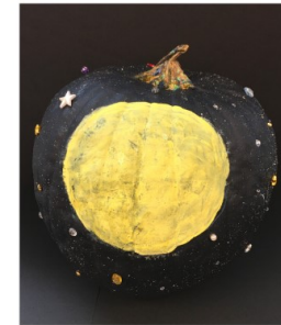
"Twinkle, Twinkle, Little Pumpkin"