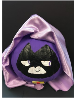
"Raven the Titan"